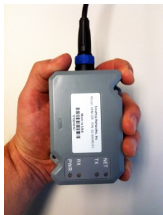
Mini Gateway Router