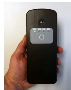
RFID Handheld Reader

For complete specifications, see individual product data sheets.